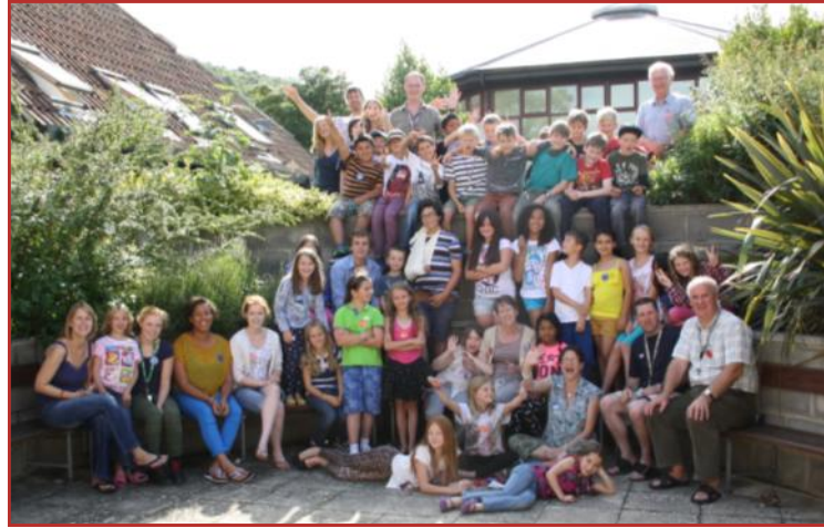
England - Camp