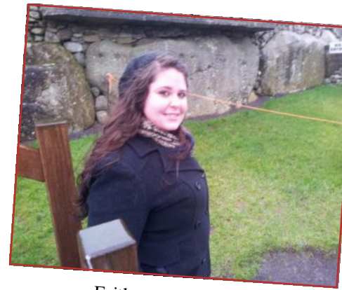
Faithe at Newgrange