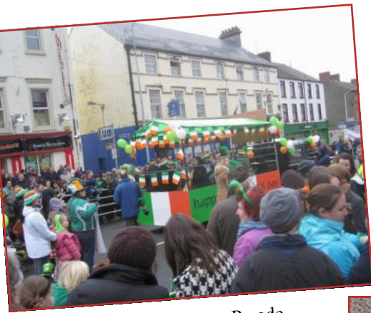
St. Patrick's Day Parade